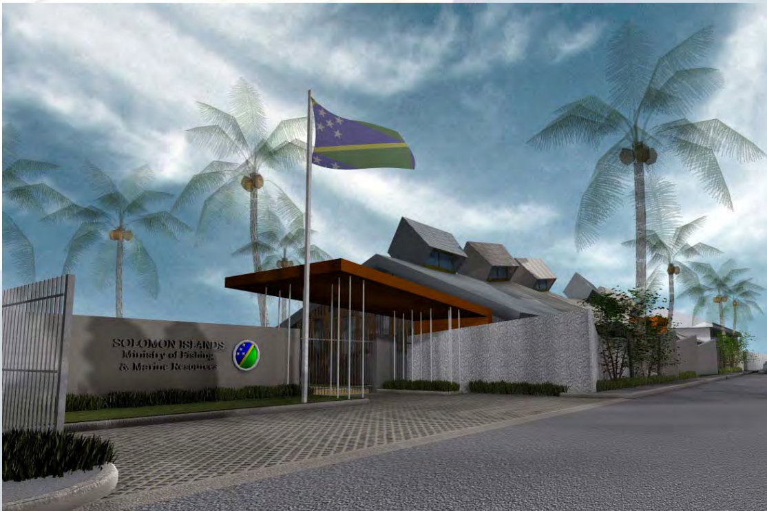
2010 SOLOMON ISLANDS MINISTRY FOR FISHING & MARINE RESOURCES OFFICES, HONIARA.