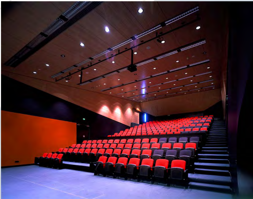
2000 LECTURE THEATRE VICTORIA UNIVERSITY, WERRIBEE INTERIOR.