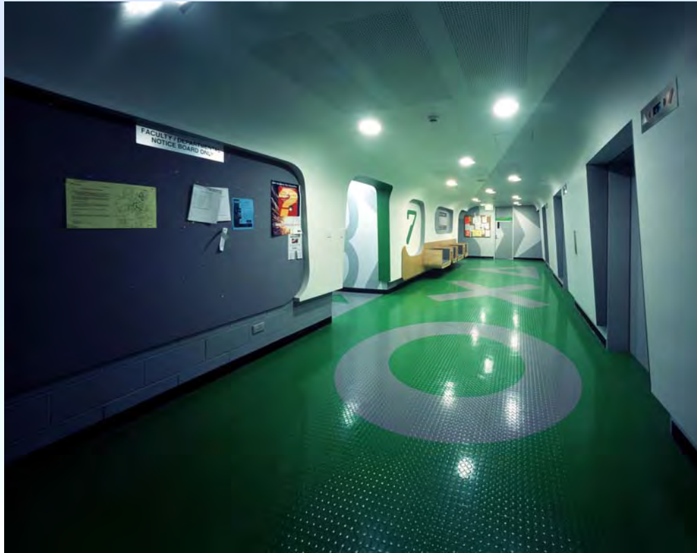
2002 RMIT BUILDING 51 REDEVELOPMENT INTERIOR.