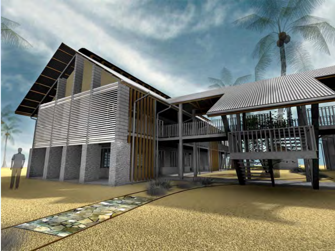
2010 NAURU SECONDARY SCHOOL, NAURU.