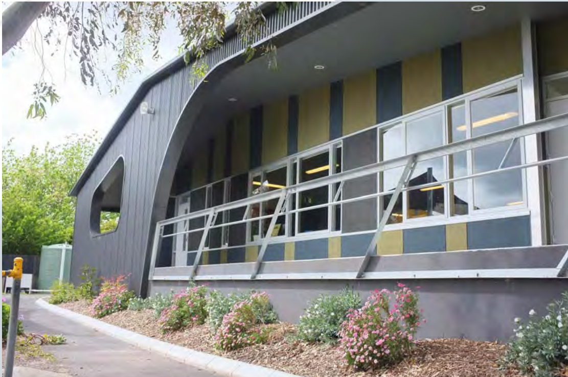
2009 ST JOHN VIANNEY SCHOOL LEARNING CENTRE, MULGRAVE.