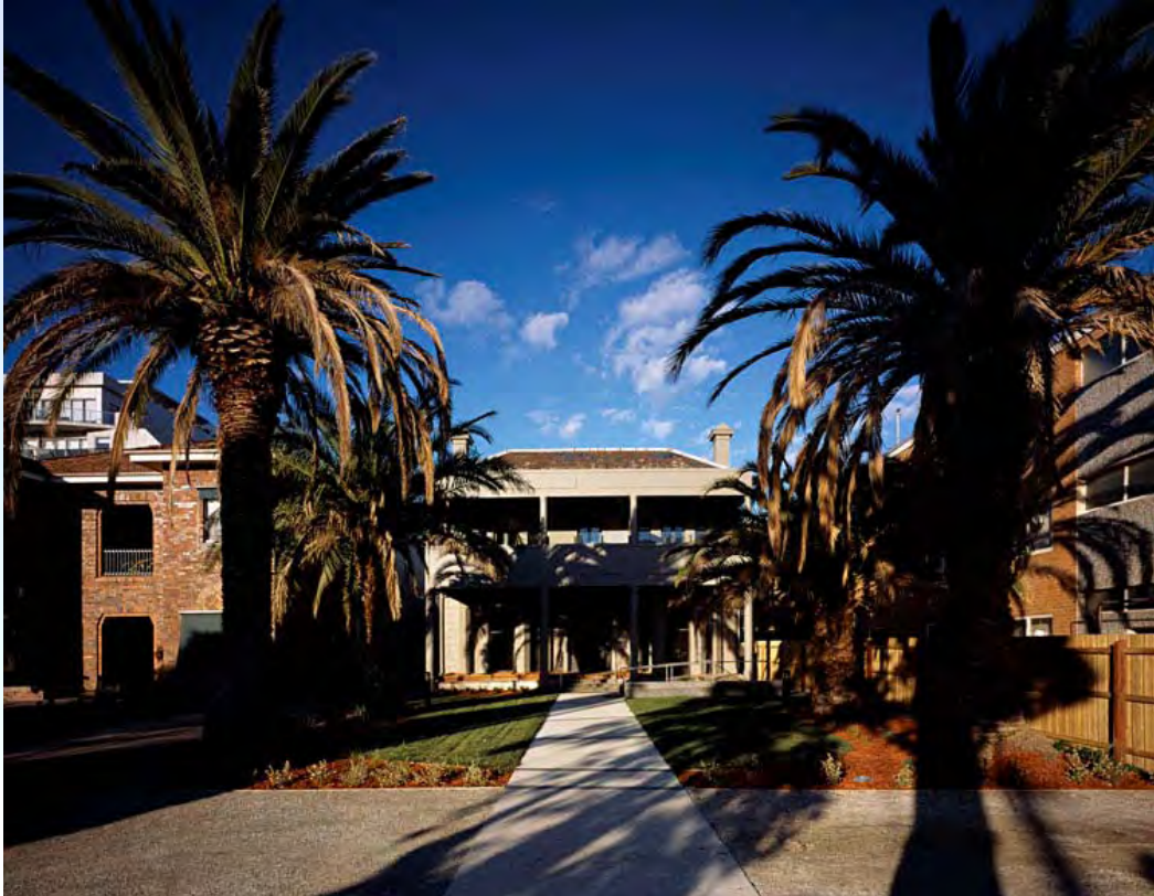
2008 PYRMONT REDEVELOPMENT, ST KILDA.