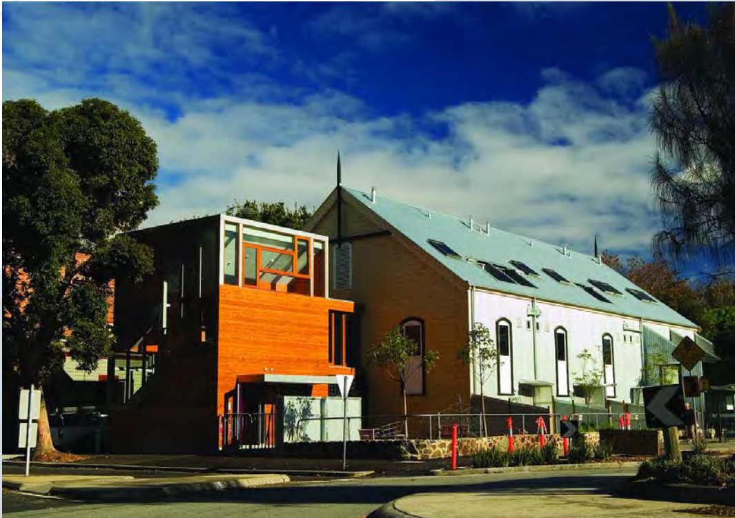
2006 EXCELSIOR HALL REDEVELOPMENT, PORT MELBOURNE.