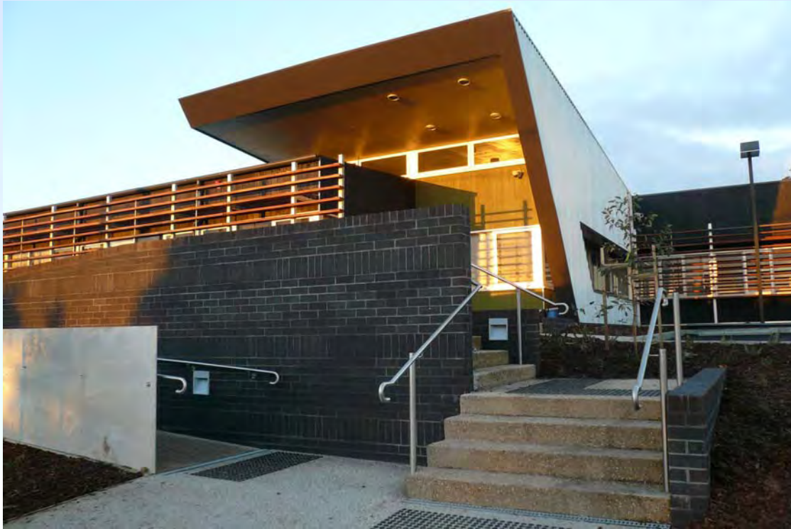
2011 SOUTHERN WOMEN'S INTEGRATED SUPPORT FACILITY.