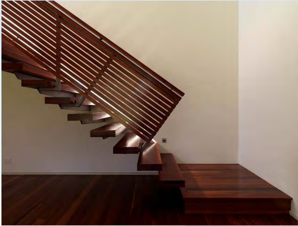
2006 BRIGHTON HOUSE INTERIOR.